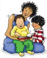
Early Reading & Mentoring Program

JUSTICE LEAGUE Park Hill United Methodist Church